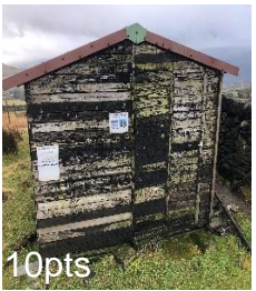
E: wood hut