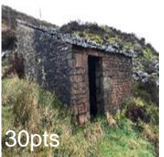
M: pump room