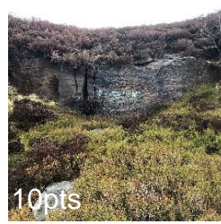
G: quarry - blue graffiti