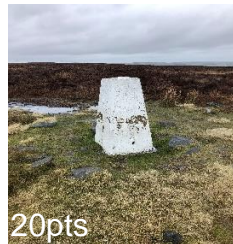
J: trig point