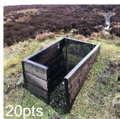
K: grouse butt #6