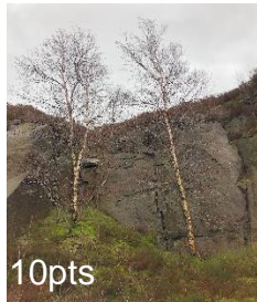
F: quarry - 2 x birch