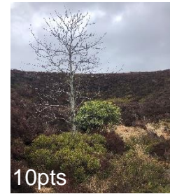
H: quarry - birch & bush